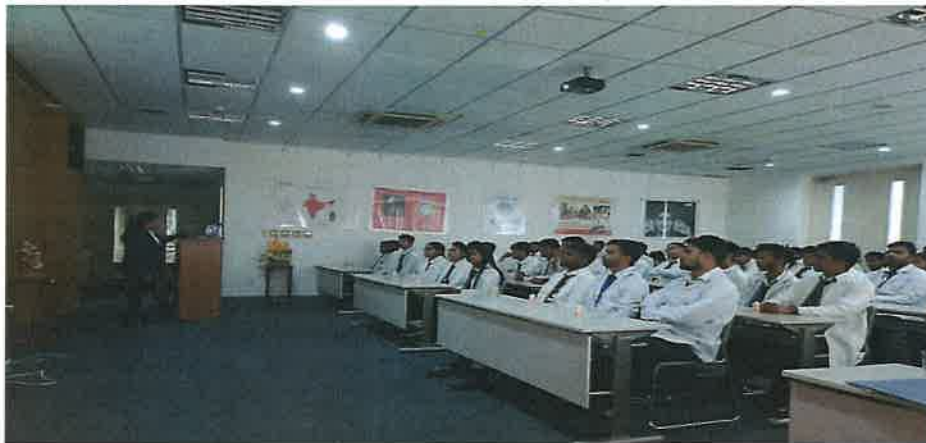
HR Explain about the company