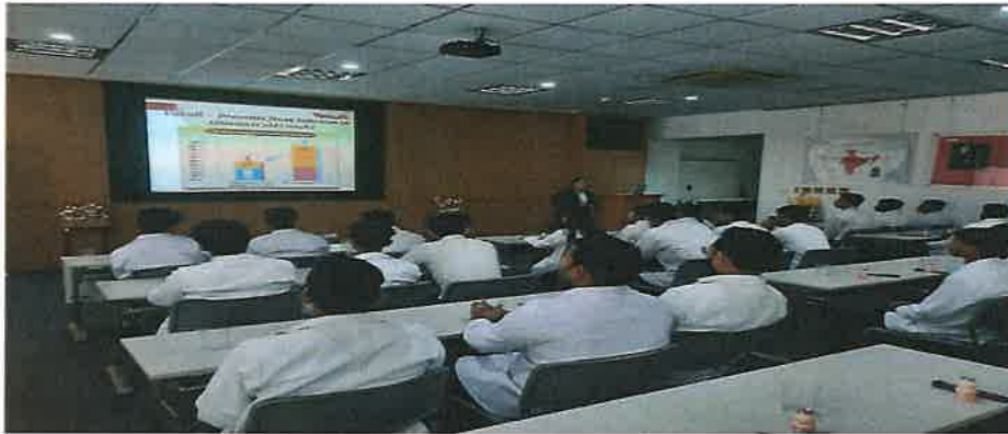
Students at seminar hall for the Presentation about Antibacterial

Affiliated To Dr. A.P.J. Abdul Kalam Technical University, Lucknow, U.P. & Approved By PCI