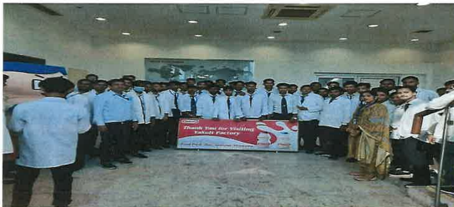
Students assemble for end of the visit