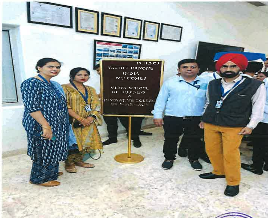
Faculty welcome at Yakult Danone